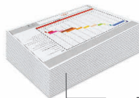
7,700 Sheets on-line